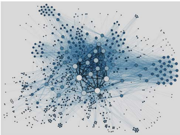
Figure 1. Inter Organizational and Intra Organizational Graphs in Social Networks

Laura et al proposed a field oriented methodology to bridge the gap between humanitarian best practices and academic state of art. In disasters which involve large scale humanitarian organizations on site, lack of effective coordination always stands as a challenge in efficient disaster management [27]. There are innumerable factors that lead to coordination difficulties, two major ones being huge number of actors and voluminous information. Since proper processing of information is not done, it ultimately results in inadequate situational awareness [28]. It is clear that there exists a gap and the best way to bridge it is by developing realistic methods with real data, problems and past and future trends [29].