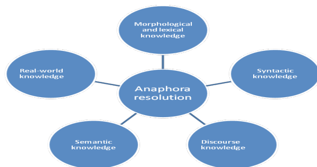
Figure 1. Ashima

The paper is assembled in following way: section 2 portrays the background. Section 3 portrays related work. Section 4 portrays research gaps .Section 5 portrays conclusion. Section 6 portrays references respectively.